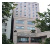
Paradise Casino Academy