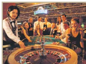
High-class refined facilities and atmosphere