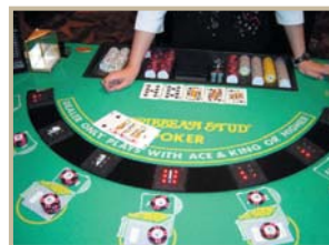
Caribbean Stud Poker