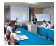
In-house service Training