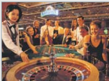
High-class refined facilities and atmosphere

■ Apply SQI (Service Quality Index) co-developed with Korea Management Association Consulting