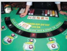
Caribbean Stud Poker

- Ongoing R&D, Introduce New Games, Build-up IT Infra