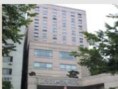
Paradise Casino Academy