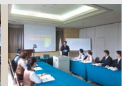
In-house service Training